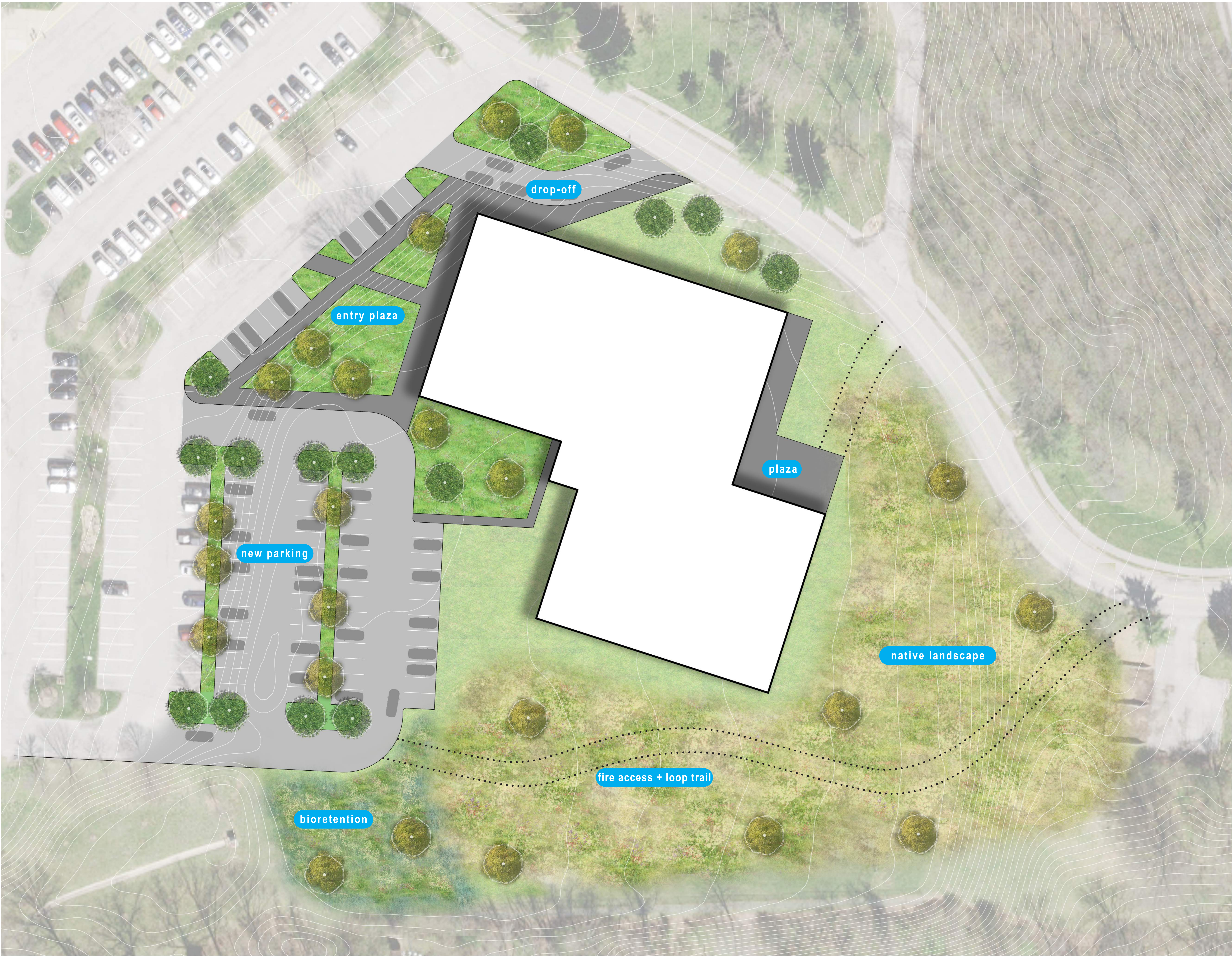
1 CONCEPTUAL SITE PLAN SCALE: 1" = 20'-0"