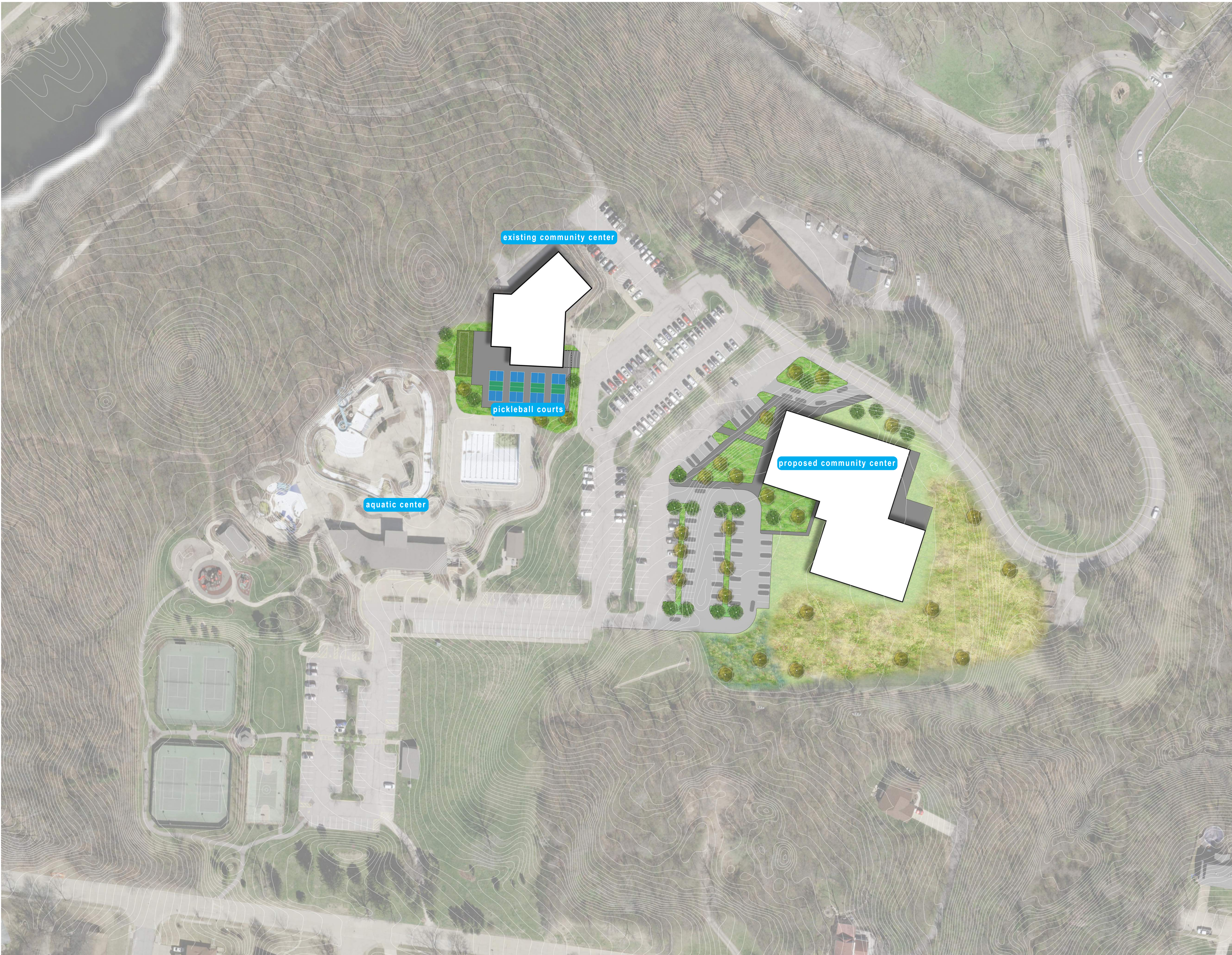
1 SITE CONTEXT PLAN SCALE: 1" = 50'-0"